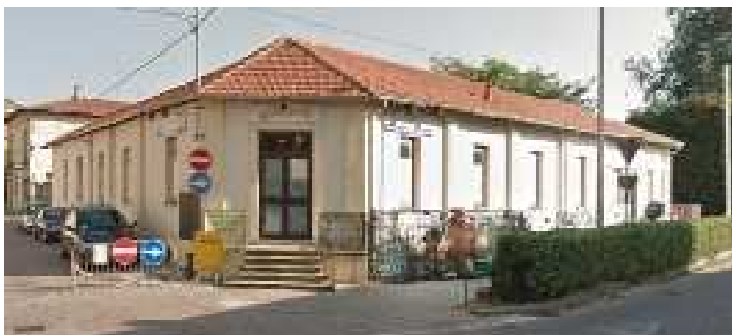
The structure of 3Effe Market in Via Filzi A Taino, in the province of Varese

The administration and management of the company ' responsibility to shareholders and owners 3 brothers , aided by the previous generation who implanted the activity.